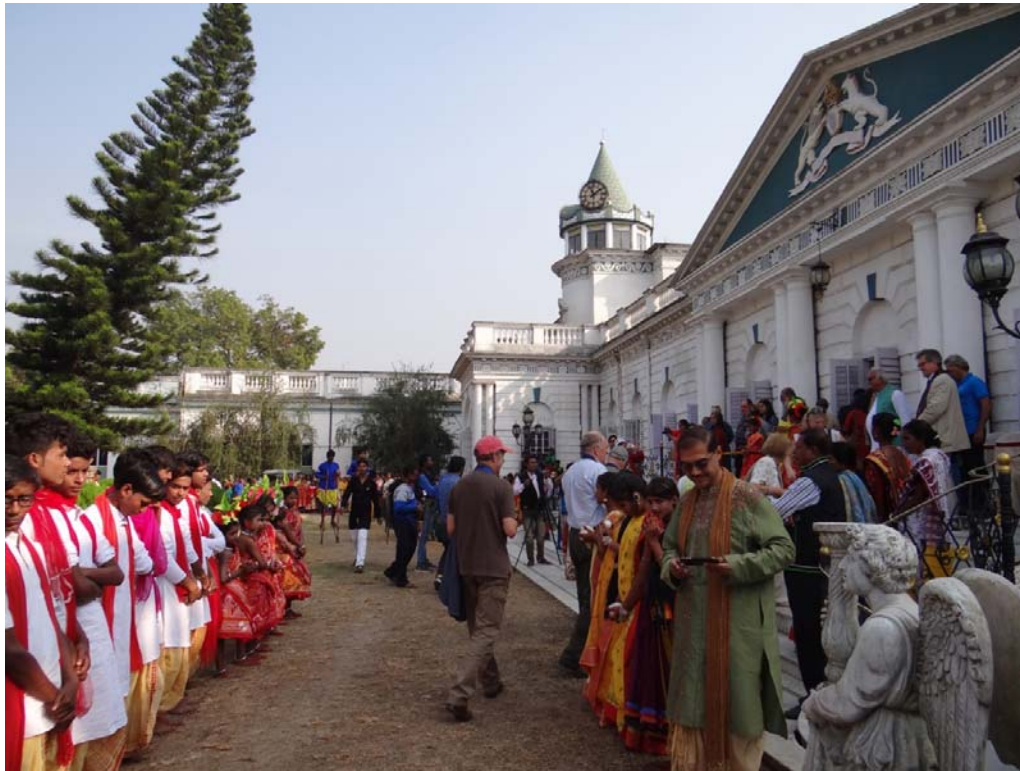
British High Commissioner with SBH members at Mass mansion and local cultural displays in Masanbad