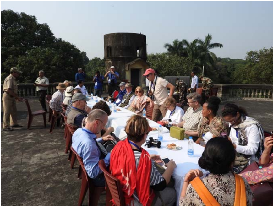
A roof terrace reception on the

Roxburgh House c1794 on the banks of the Hooghly River in the Indian Botanical Garden at Shibpur, Howrah. Many botanists were recruited by the East India Company, a being Scot William Roxburgh, regarded by many as the founding father of Indian botany