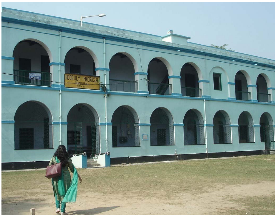
The trip to West Bengal in December was a great experience, well organized by our new India colleagues, ever elegant as they are. This was at the former 17th century Dutch fort barracks at Chinsurah, still in use by the local community now the madras school.