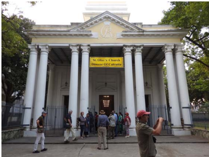
St Olav's Church c1806 in the Danish settlement of Frederiksnagore, now Serampore. It was restored by the National Museum and Serampore Collage, with assistance from the Danish Ministry of Culture Fund. It won the 2016 UNESCO Asia Pacific Award. The entrance has an open portico of twin columns under a broken-base pediment containing the royal monogram of King Christian VII. It reflects the designs of British India, in particular those in Calcutta, which in turn were inspired by contemporary designs popular in Britain, such as St. Martin-in-the-Fields in London