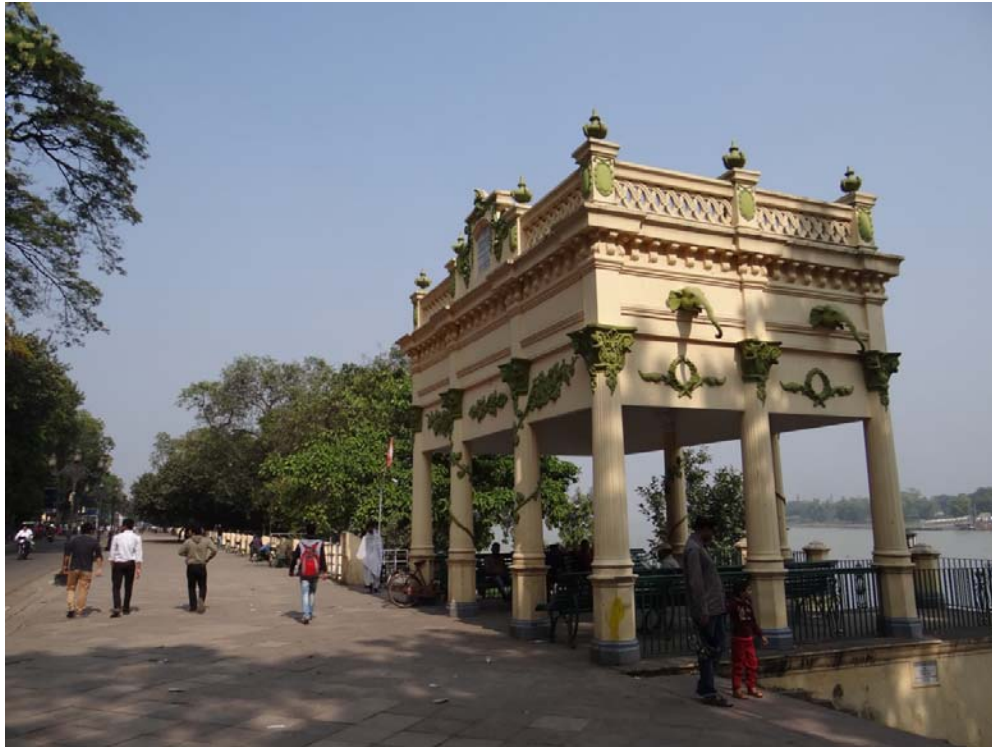
French foreshore promenade and pavilion at Chandannagar (formerly Chandernagore) alongside the Hooghly River - a cultural landscape one would not easily expect to find in India. Since it is standing in India, it is a fine example of shared heritage, now a landmark for the city. [words: B Goes]