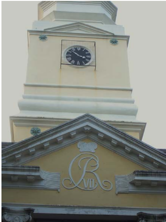
An example of seemingly 'alien' architecture in India, the Olav Church in Serampore, crowned with the initials of King Christian VII of Denmark.