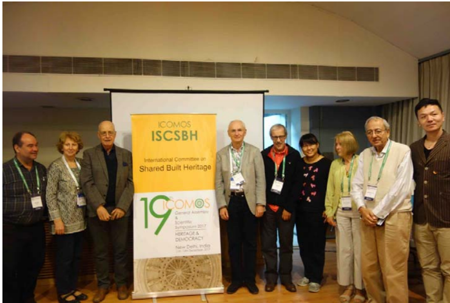
International ICOMOS International Scientific Committee for Shared Built Heritage Annual General Meeting part B held on 9 December 2017 in New Delhi, India