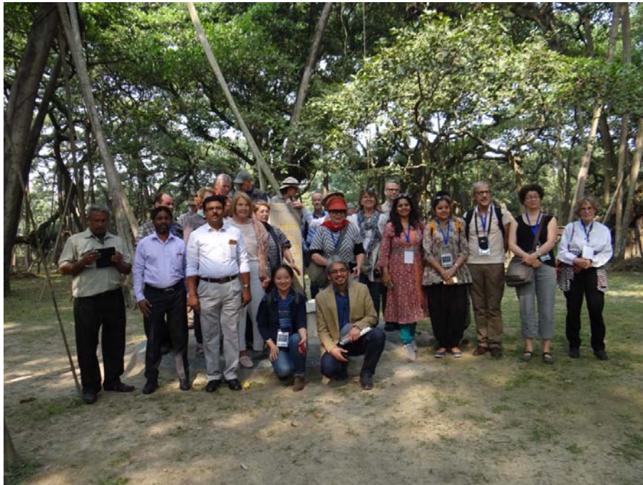
Kolkata Botanical Gardens - the SBH group under the canopy of the 250 year old Great Banyan Tree covers 3.5 acres, and claimed to be the widest tree in the world