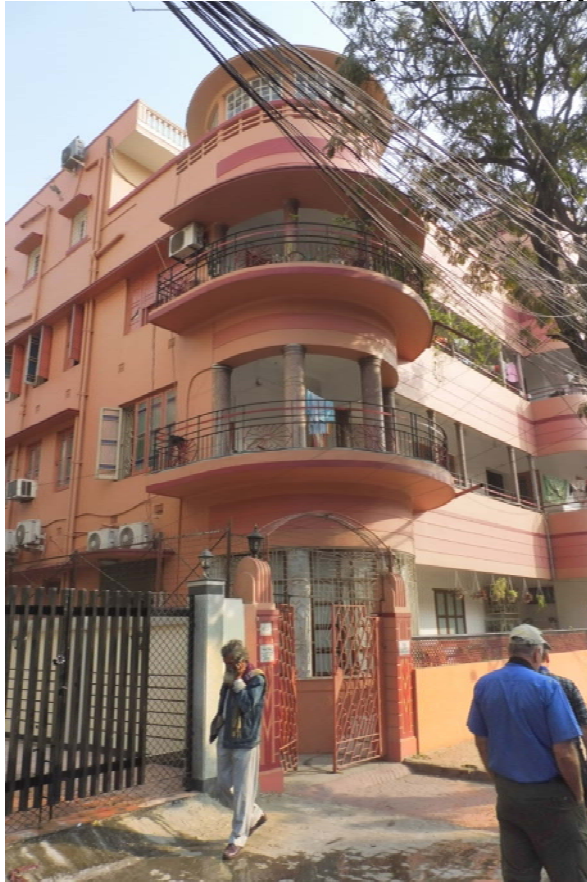
Another example of SBH that I was most intrigued with was the adaptation of Art Deco in South Kolkata which was introduced well after independence.