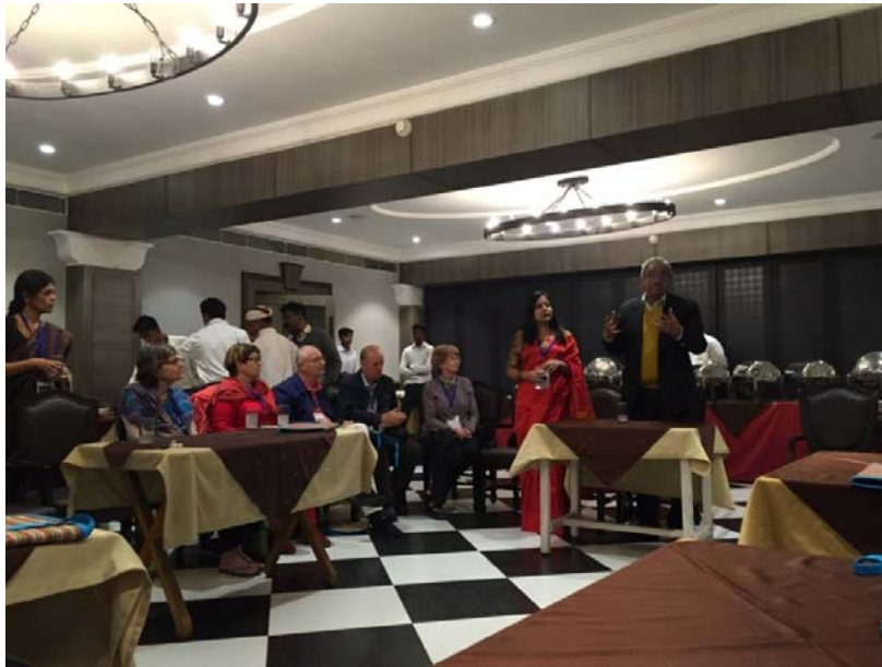
SBH Study Tour welcome and dinner in the board room of The Calcutta Swimming Club (1 Strand, Dalhousie, Kolkata). The Club is the oldest in India, began in 1887 although this building dates from c1923.

West Bengal Study Tour & Symposium 2017 participants contributions