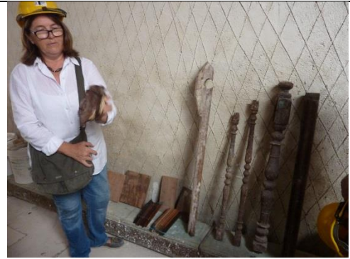
George Town WH shop house adaptive reuse project - explaining the techniques and materials conservation approach (sjs)