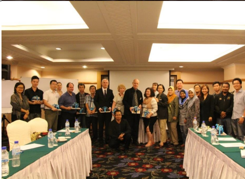
SBH delegates with NGOs and Agencies' representatives at the George Town symposia, Penang State, Malaysia

NOTE Suffolk House restoration was assisted by Australia ICOMOS members and Aus Heritage