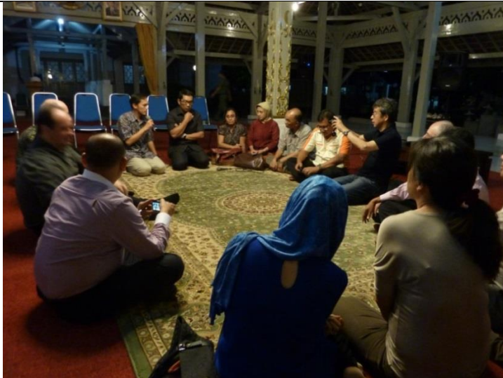
With Bandung City Mayor, Mr Ridwan Kamil in the City's traditional West Java Meeting House