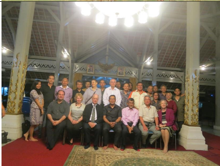
SBH delegation with the Mayor of Bandung, Mr Ridwan Kamil, and City planning officials and NGO representatives in the City's Traditional Meeting House