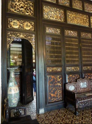
In the George Town World Heritage precinct SBH inspected the The Blue Mansion (Cheong Fat Tze Mansion) adapted to a boutique hotel