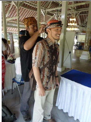
Bandung intangible and cultural activities – our visit coincided with West Java Day – Isb members earning how to do West Java traditional attire.