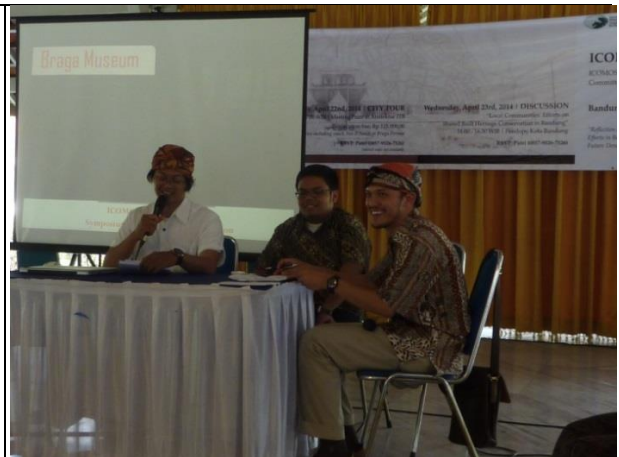
Banding presentations held in the Mayor's traditional Meeting House (sjs) and included historic precincts such as the Gedung State Conservation Area