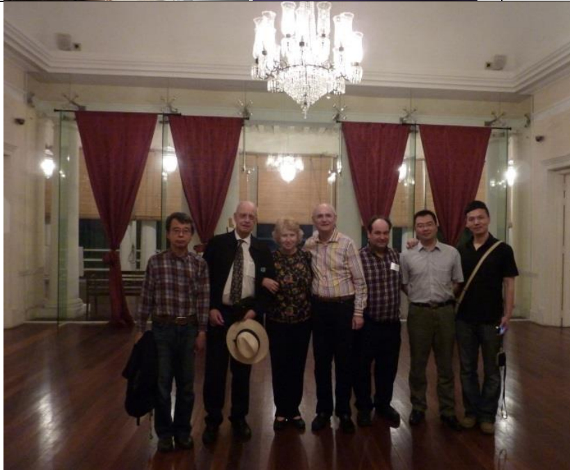
SBH delegates prior to meeting with the Chief Minister of Penang State, Mr Lim Guan Eng, at the restored plantation "Suffolk House".