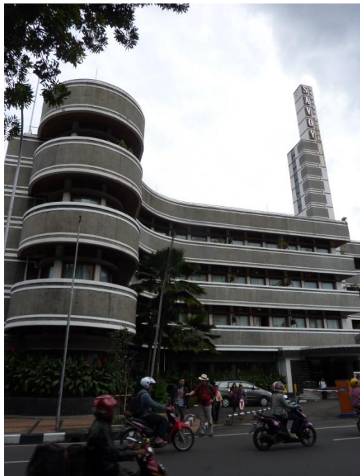
Bandung CBD historic precinct tour of its Art Deco buildings – this is The Savoy Hotel