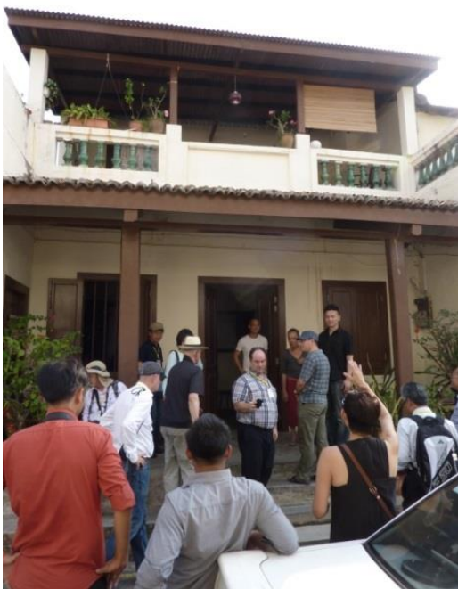
Inspecting shop house adaption in Melaka WH precinct