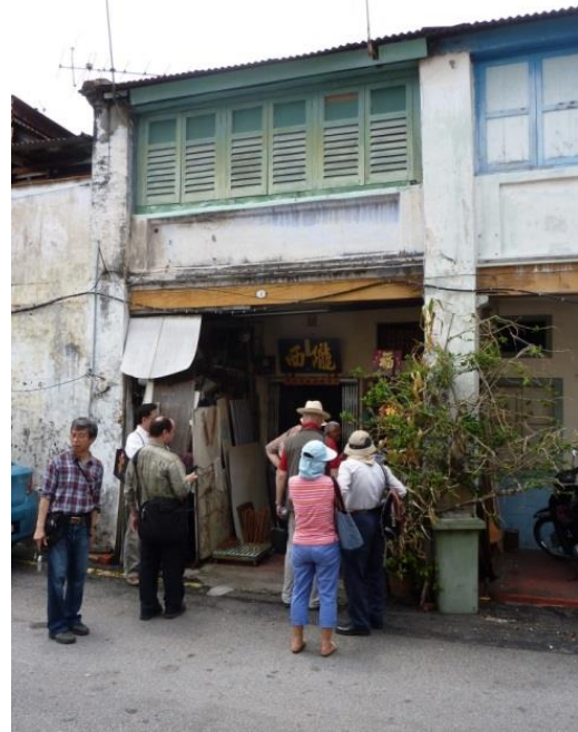
Retaining traditional skills in George Town WH precinct