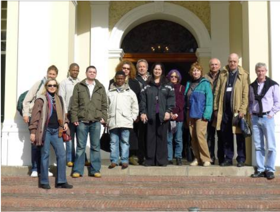
“Shared Built Heritage in Africa” symposium delegates on the Cape Town tour