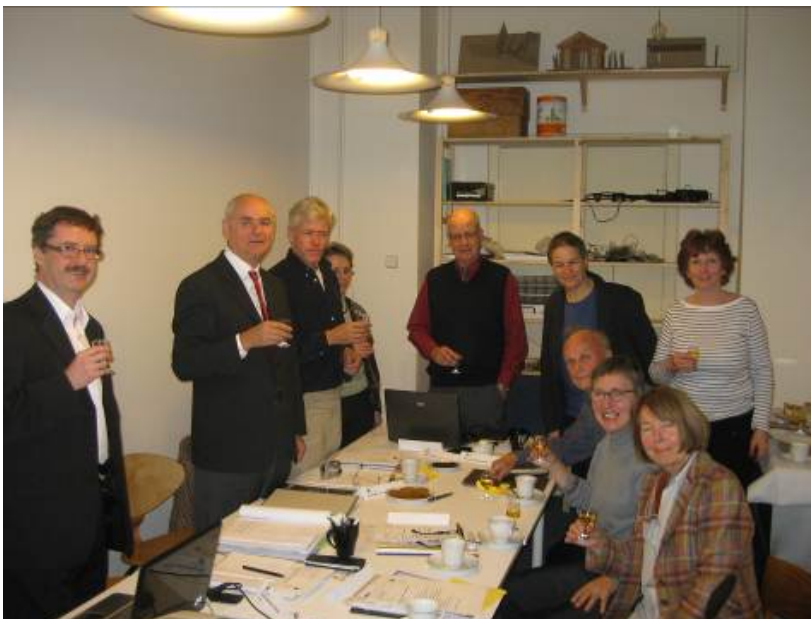
International participants of the SBH Committee (from left)