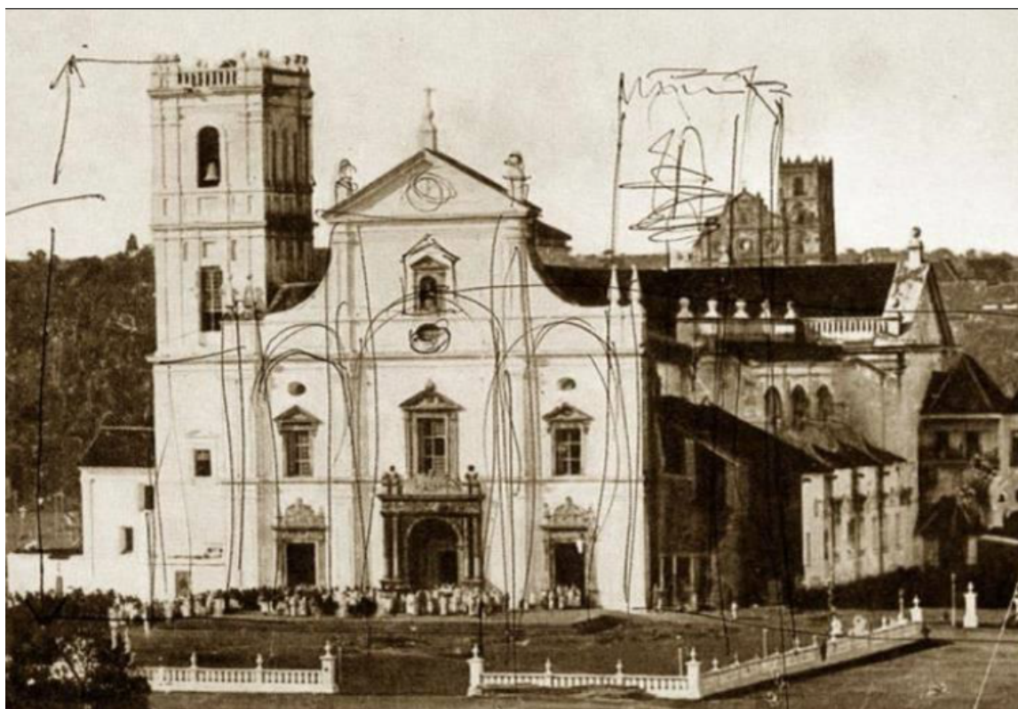
Analytical sketch of the See Cathedral of Goa, India; draft over photography, Mário Chicó, 1951