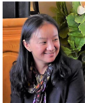
VP Ai Tee Goh