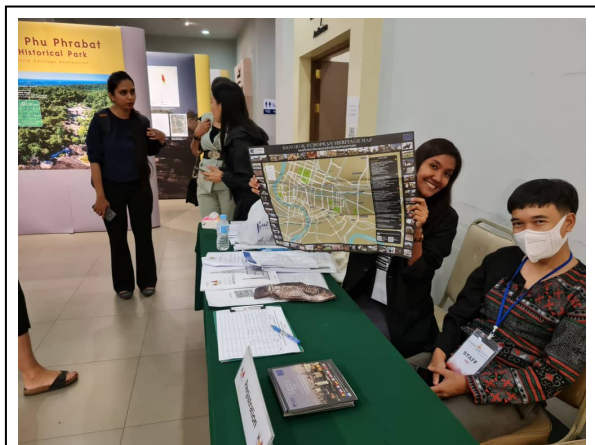
Sharing of EUNIC Heritage Map at the AGA 2022