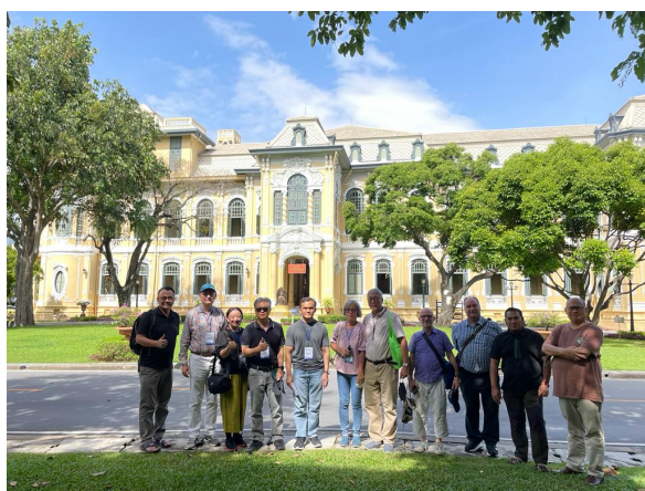
Members from ICOMOS Malaysia joining the guided tour at Bang Khun Phrom Palace on 29 Oct 2022