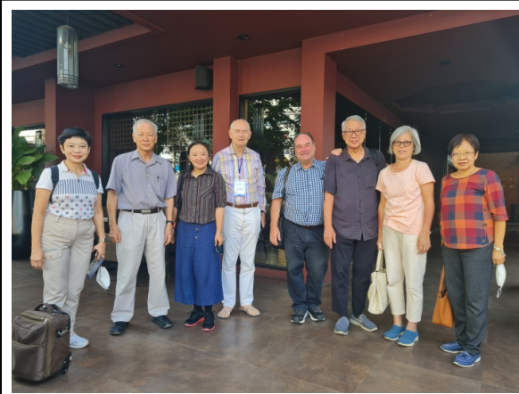
Members who joined the ICOMOS ISCSBH Thailand Study

Last but not least, we would like to thank our colleagues from different countries who joined the study trips and made this a meaningful and memorable shared experience.