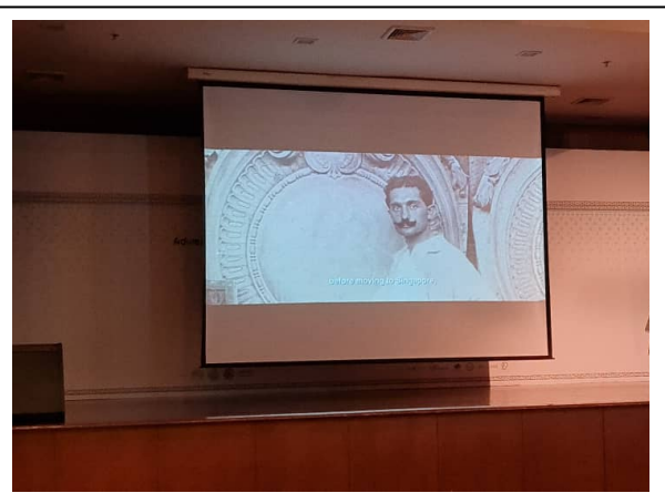
Sharing of the 70-mins short film ( Me and the Magic Door )