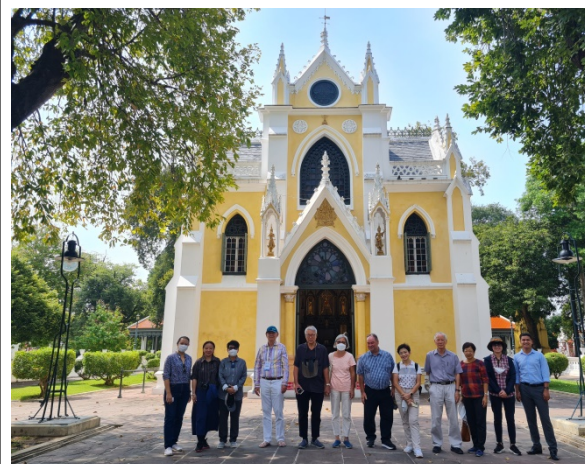
Experts from Ayutthaya Heritage Park provided a guided tour around six SBH places in Ayutthaya