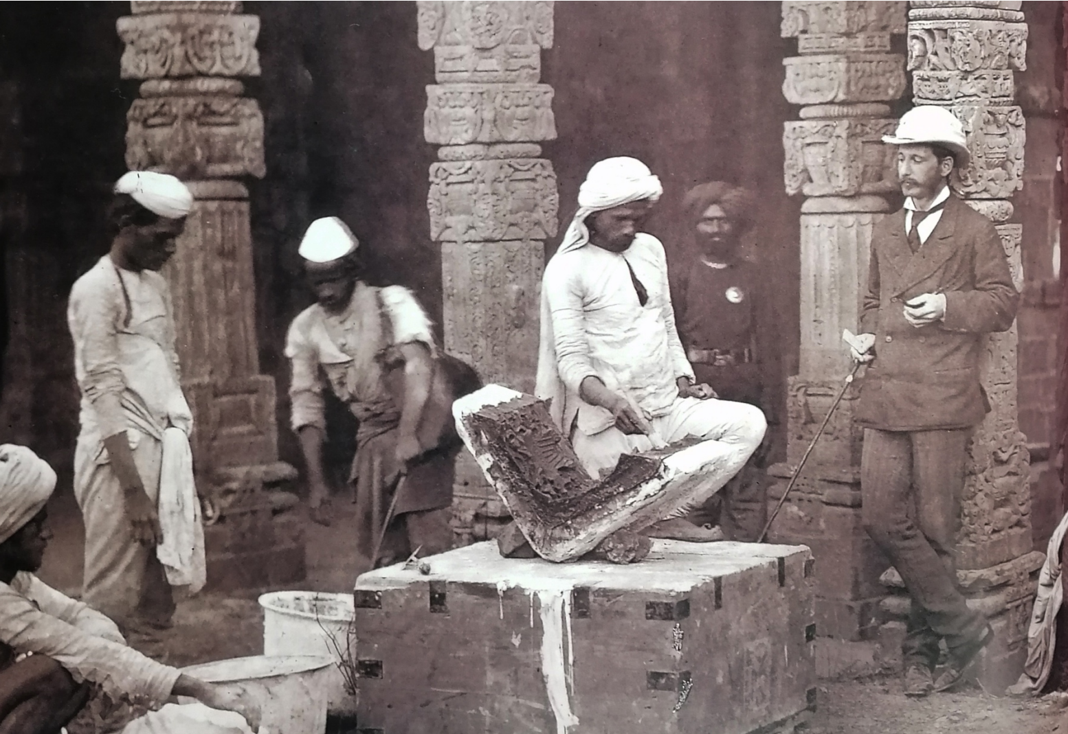
Casting operation in the courtyard of the Quwwat Al-Islam Mosque, Delhi; photography by Charles Shepherd, 1870 (source: Arundel Society. London)