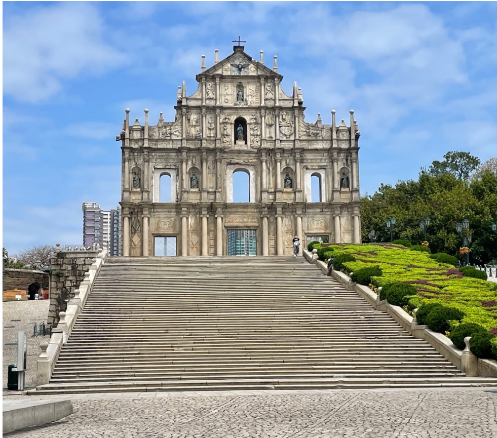
St. Paul Ruins, former Mater Dei Church, Façade and Staircase. Classified Monument, Law 11/2013, Macau. Part of Macau Historic Center, UNESCO classified list, July 15, 2005.